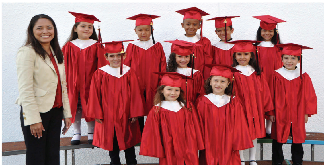
K-5 Graduation - 2011