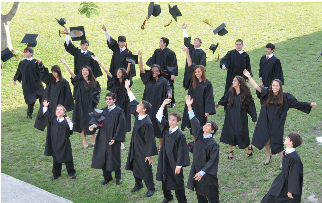
8th Grade Graduation