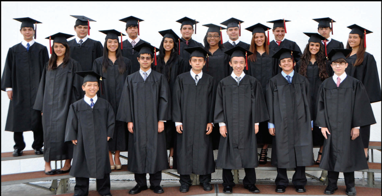
8th Grade Graduation - 2011