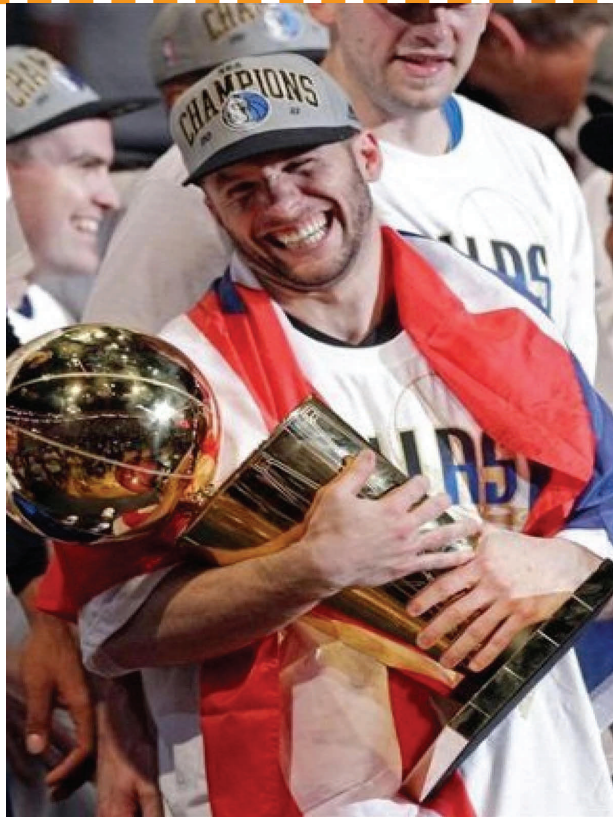
J J Barea holds the NBA Championship Trophy