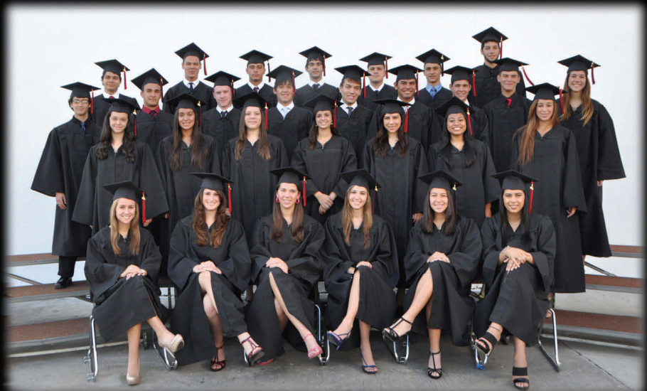
Senior Graduating Class - 2011

This year's graduating class of 30 students was accepted to over 40 different colleges and universities; 65% of the class received more than $600,000 worth of first year scholarship offers and over $2.5 million in four year offers.