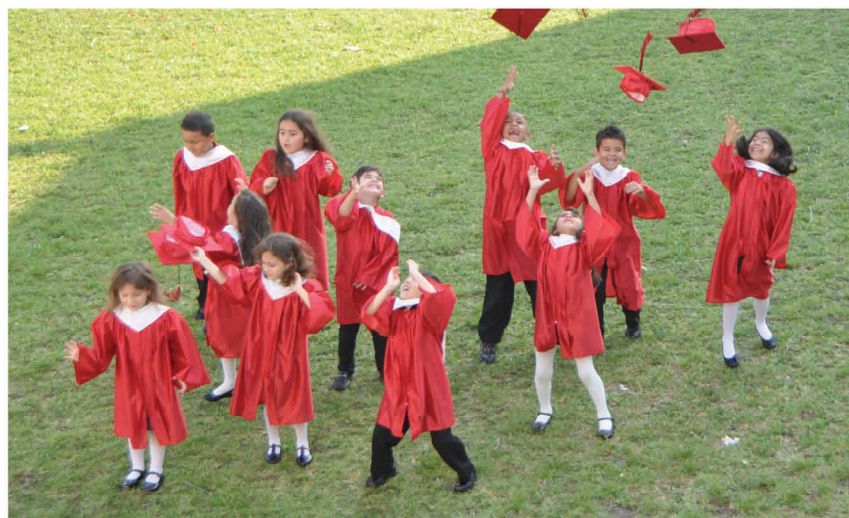
K-5 Graduation - 2011